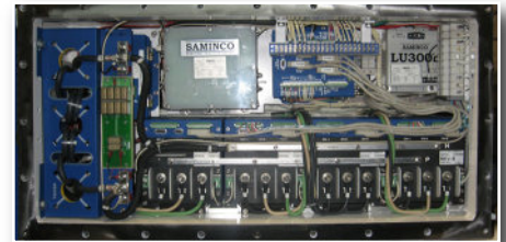
(VARIABLE FREQUENCY DRIVE) CONTROL PANEL 480/ 575 / 950 VAC - 600 VDC

HIGHLAND OFFERS THE LATEST UPDATES FOR YOUR MACHINE SUCH AS: