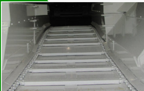
4.1 PITCH CONVEYOR CHAIN OR OPTIONAL DUAL LOADER CONVEYOR CHAIN