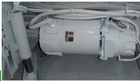
OPTIONAL SERVICE JACKS

HIGHLAND OFFERS THE LATEST UPDATES FOR YOUR MACHINE SUCH AS: