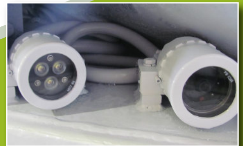
OPTIONAL LED LIGHTS, CAMERA SYSTEMS AND PROXIMITY SYSTEMS