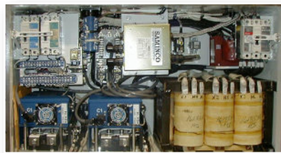
SCR OR IGBT CONTROL PANEL

CUSTOM MODIFICATIONS CAN BE MADE TO MEET MINE APPLICATIONS