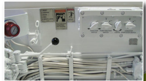
CHECK ALL HYDRAULIC PRESSURES FROM ONE CONVENIENT LOCATION